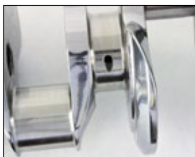
Ultra LS cranks can be purchased with or without large fan angle center counterweights