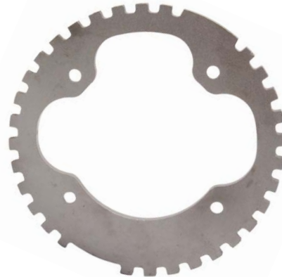
32 Tooth 6.4 OEM Reluctor