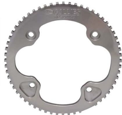
58 Tooth 6.4 Billet Reluctor