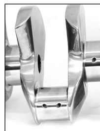
Aeroshed finish and Ultra-Shed counterweight profiling.