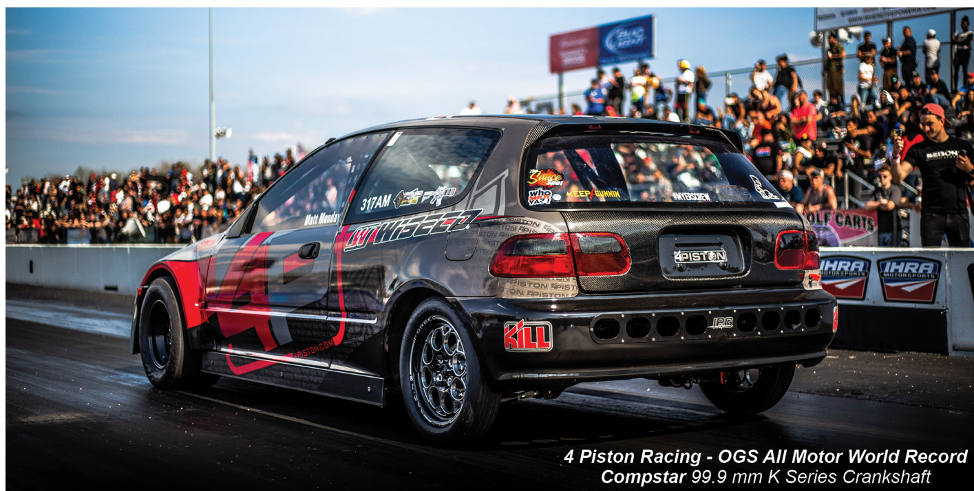
4 Piston Racing - OGS All Motor World Record Compstar 99.9 mm K Series Crankshaft